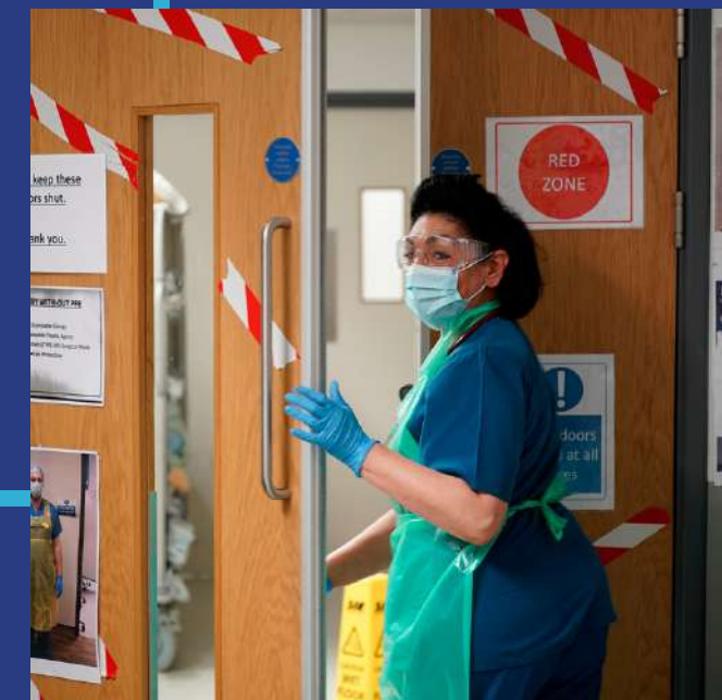
Virtual support for chronic pain