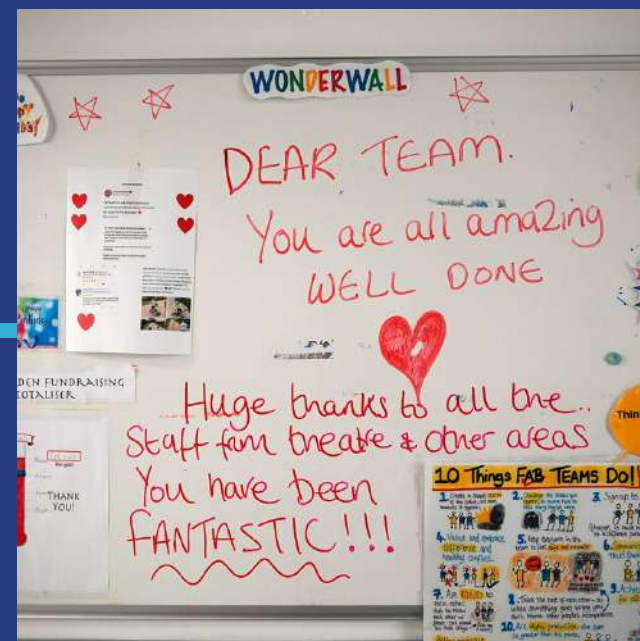
Arts in Health initiatives