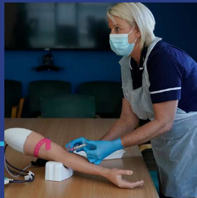
Equipment to help staff prepare for redeployment