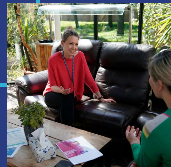
Provision of Talking Therapies