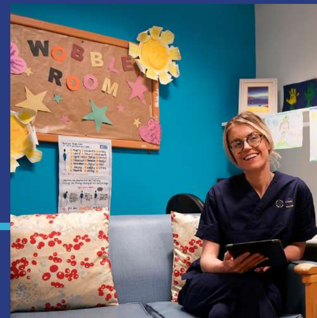
Tablets and digital devices for staff & patients