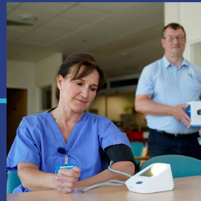
Blood pressure monitors for patients self-isolating